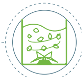
washing and grinding